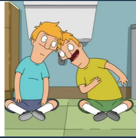
Screen capture from Bob's Burgers