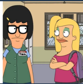
Screen capture from Bob's Burgers